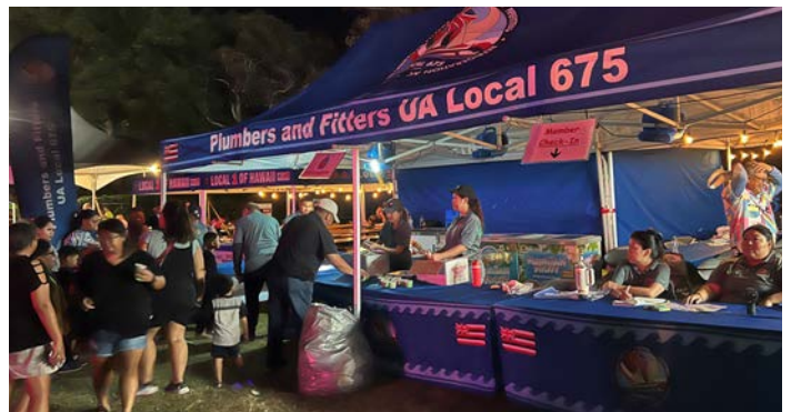
Plumbers and Fitters tent serving Samurai Ice Cake and Ju Mui Icy Pops to members.