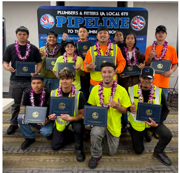
Graduates of the Pipeline to the Plumbers Union – High school Juniors and Seniors from various high schools.