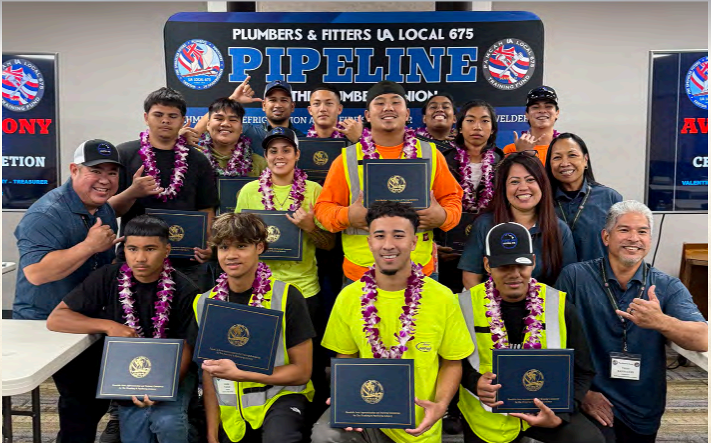
Training Staff with Graduates of the Oahu 2025 'Pipeline to the Plumbers Union' Program.

The Pipeline to the Plumbers Union program kicked off spring break for 12 outstanding high school students on Monday, March 17, and continued throughout the week, culminating in a special graduation ceremony on Friday, March 21. These students, all currently enrolled in the Building & Construction Pathways program, were selected from Leilehua High School, Pearl City High School, Kapolei High School, Moanalua High School, and Waipahu High School.