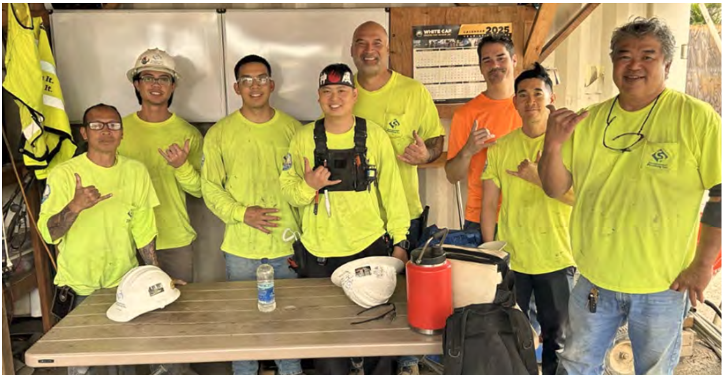
Halawa View Apartments. Commercial Plumbing. GC: Nordic PCL.