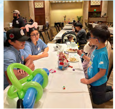
Keiki and families enjoy fun activities like balloon making, games, crafts, a photo booth, and more.