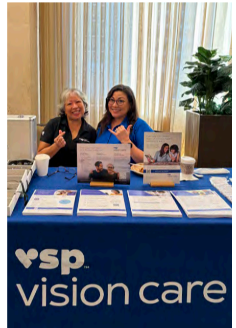
Healthcare vendors such as HMSA, VSP, and HDS were present to answer member questions and provide valuable benefit information. Free health screenings were also offered.