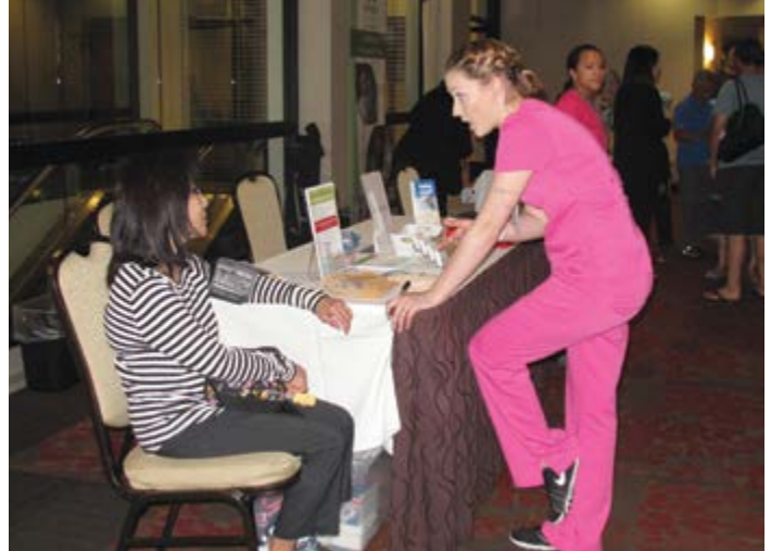
Urgent Care Hawaii enjoys a busy day checking the blood pressure of health-concerned visitors.