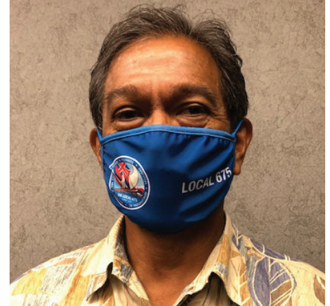
For your safety and the safety of others. New Local 675 face masks and neck gaiters will be mailed in October to all active members. Make sure your address is updated if any changes.