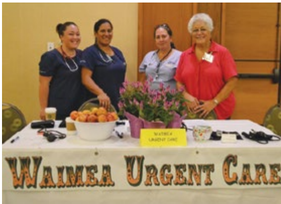
The smiling ladies are ready to explain what their Waimea Urgent Care facility can provide. Local 675 families found other service participants equally helpful.