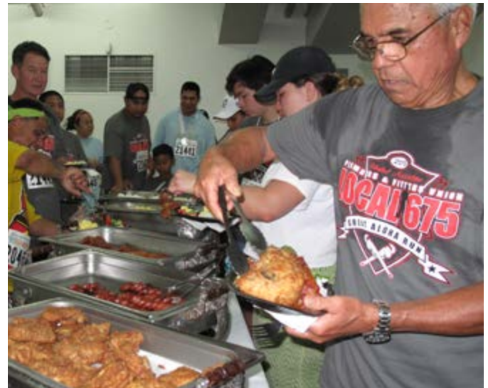
Members and their families in line at the Union's breakfast buffet.