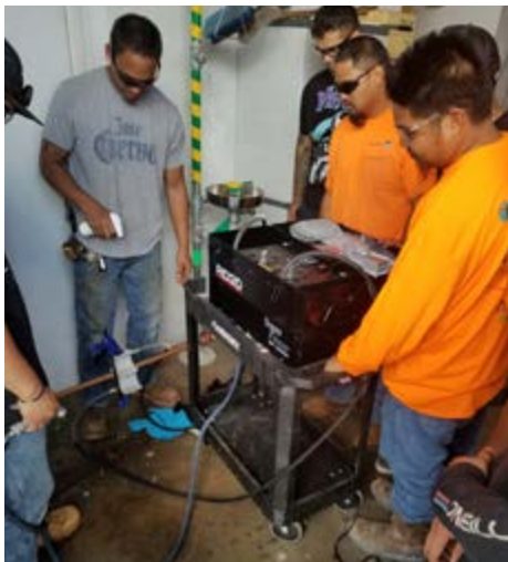
Grant provided plumbing repair equipment for training.