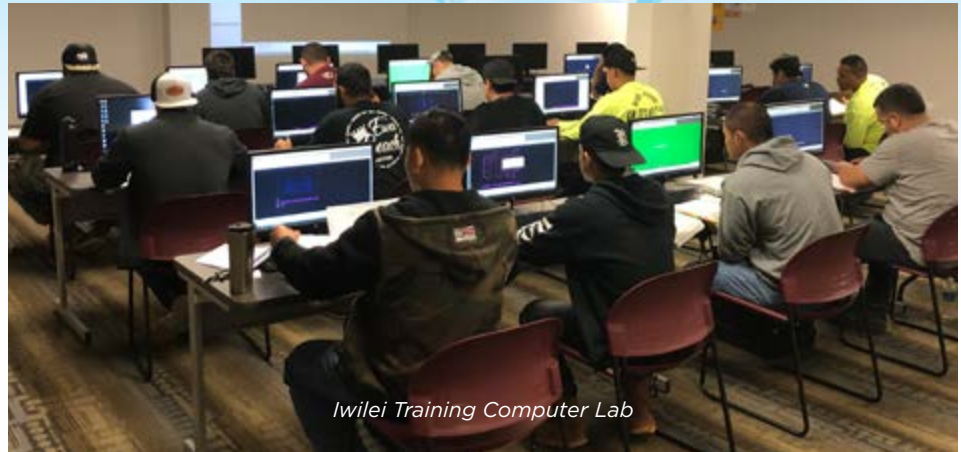
Iwilei Training Computer Lab

and electrical card trainers, new welding machines and plumbing service tools. He stated that they had recently completed upgrading computers at the Iwilei training computer lab and working to install new welding machines at the Pearl City training facility. The new plumbing service tools are currently being used in the plumbing service class and other grant items are still coming in.