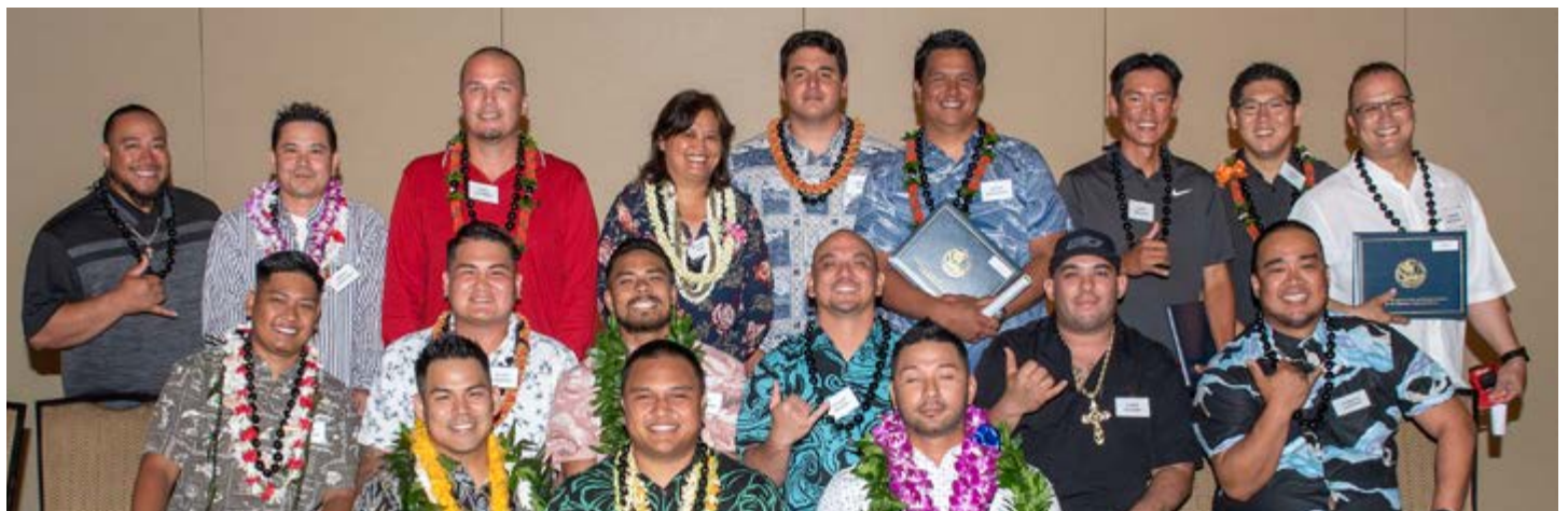
Happy group of graduating apprentices.