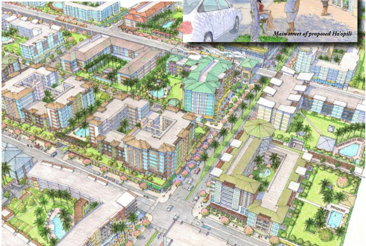
Birdseye view of proposed Transit-Oriented Development (TOD) for Ho'opili