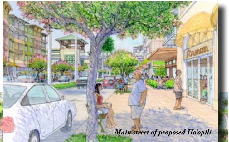
Main street of proposed Ho'opili

Castanares said such major developments help sustain and improve apprenticeship and training programs and ensure that manpower kept regularly as possible on the job represent a vital segment of our society.