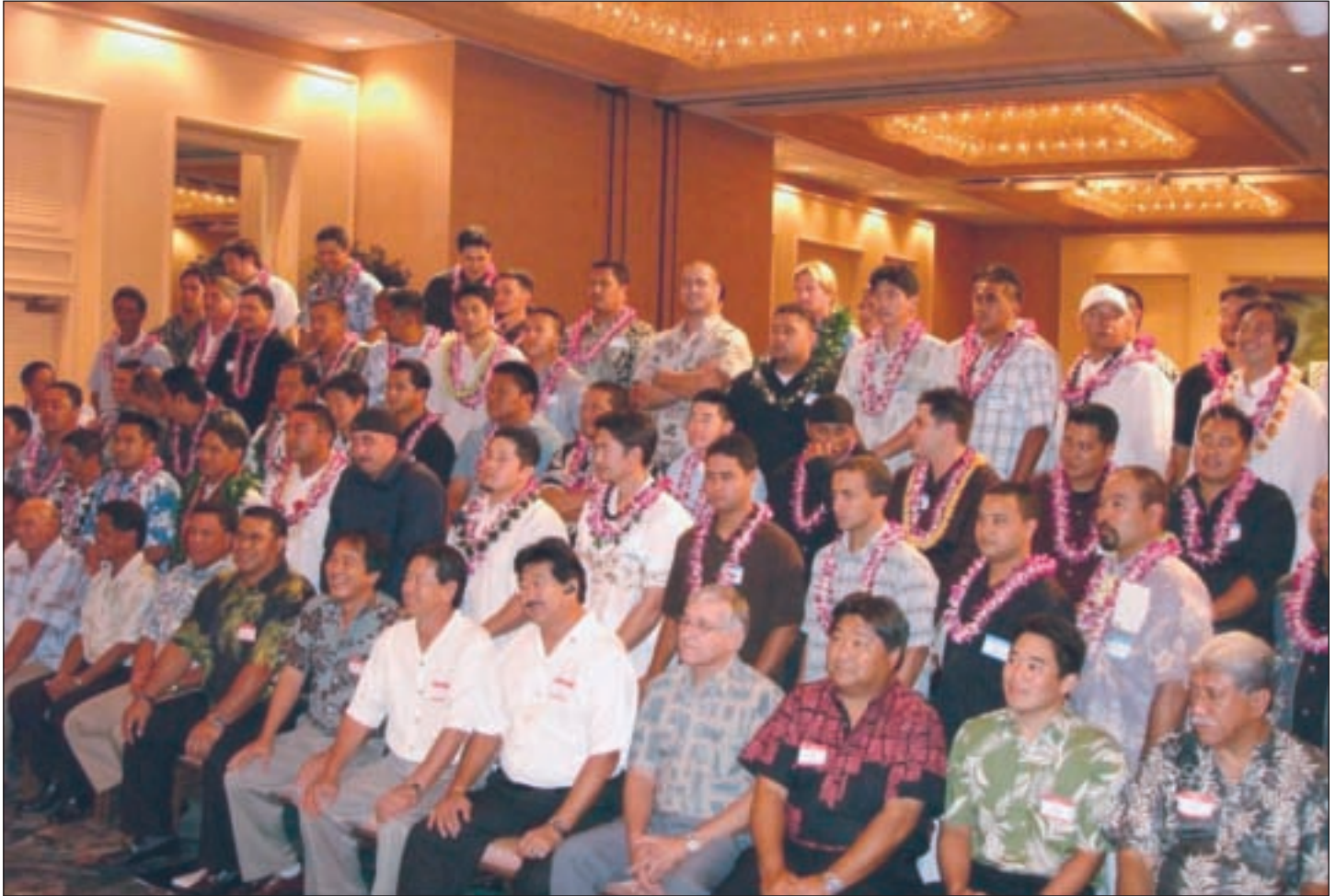
Most recent apprentice graduates celebrate with Local 675 officials and the training staff

OFFICIAL PUBLICATION OF THE PLUMBERS AND FITTERS UNITED ASSOCIATION LOCAL 675, AFL-CIO