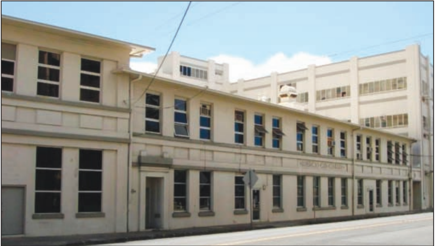
Undergoing current renovation and ready for occupancy by late summer is the UA Local 675's recently purchased building in Iwilei, adjacent to the Dole Cannery office/visitors complex. The structure will include space for classrooms supplementing those at the Pearl City training workshop.