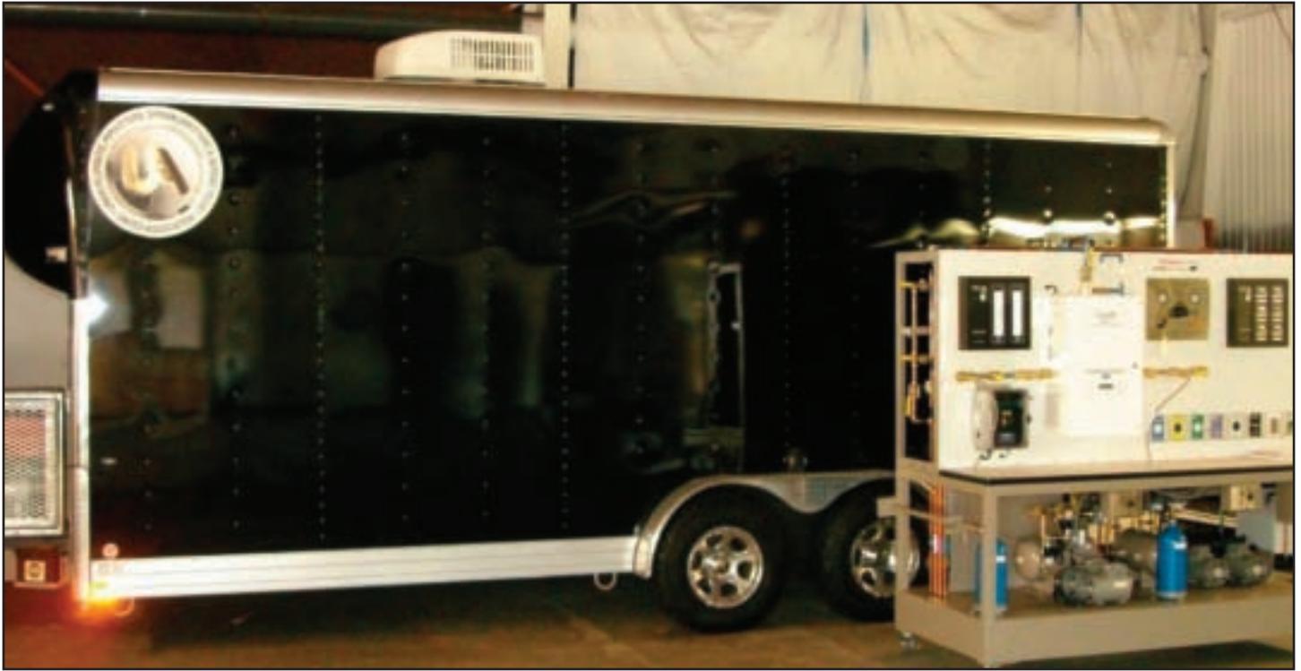
Exterior, above, and interior views of the Union's mobile trailer, first of its kind among island building trades. The traveling education arm, provided by a grant from Local 675's parent UA, has captured statewide interest since its debut in 2005. The UA last year made available a second trailer to accommodate increased requests from the Neighbor Islands, schools and job fairs.