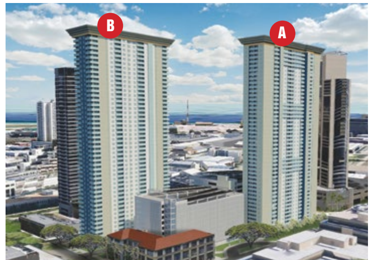
Work on Tower B for the 801 South Street condo complex was held by a court order based on complaints state law was not adhered to. A review is pending and work resumption is expected.