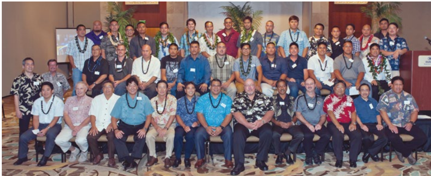
The Class of 2014: Front row are mostly PAMCA and Local 675 members who oversee the apprenticeship program. Behind them are the graduates present at their commencement along with members of the training staff and instructors.

T he 45 recently graduated apprentices saluted June 28 at the PAMCAH-UA Local 675 commencement got fresh encouragement from industry and state leaders in a turning point of their trade career.