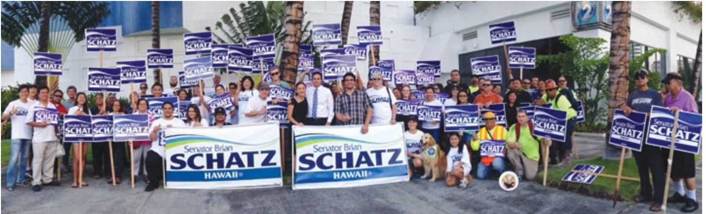
Local 675 joined other Team Schatz supporters for a couple of hours of sign-waiving before Senator Brian Schatz headed in for the KHON/AARP Debate.