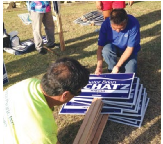
Local 675 members helping Team Schatz breakdown after sign-waving.