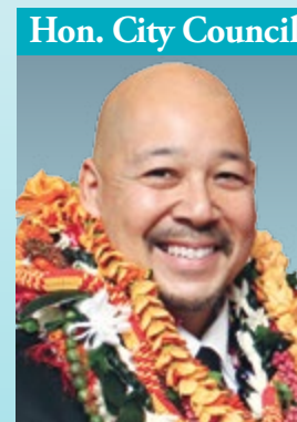
Hon. City Council