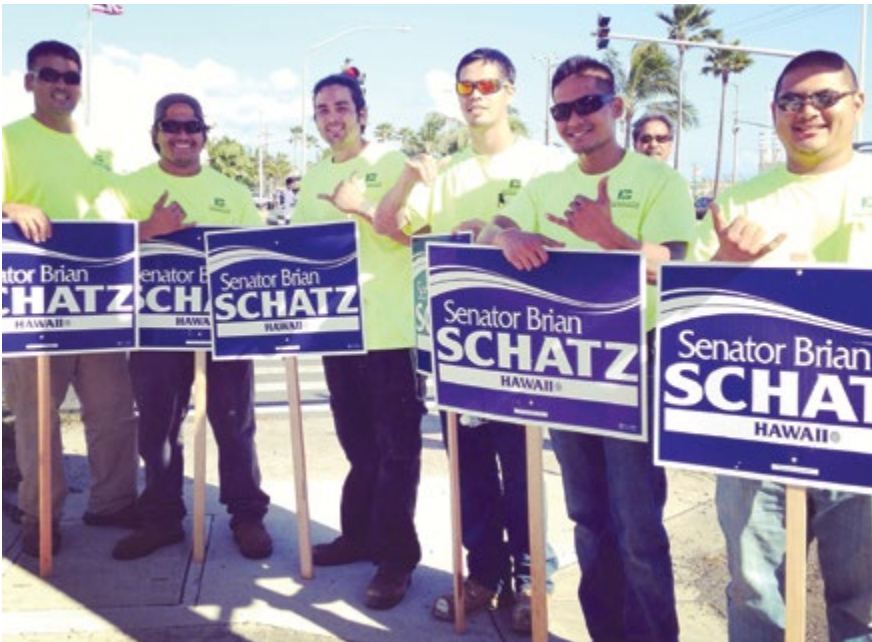
Local 675 members gearing up to sign-waive for Senator Schatz.