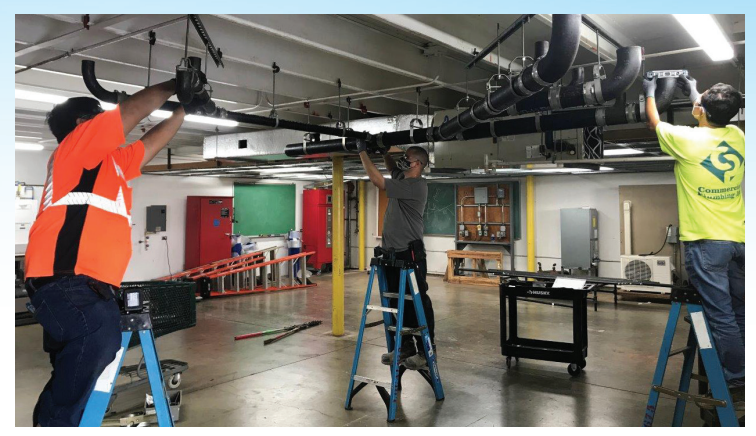
Fall 2020 Apprenticeship Training during COVID-19.