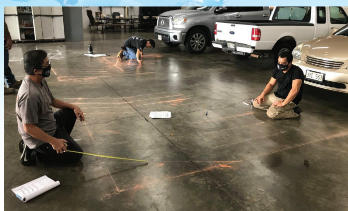
Hands on apprenticeship training continues with health and safety guidelines in place.