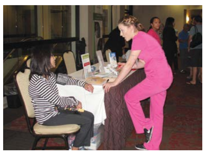
Urgent Care Hawaii enjoys a busy day checking the blood pressure of health-concerned visitors.