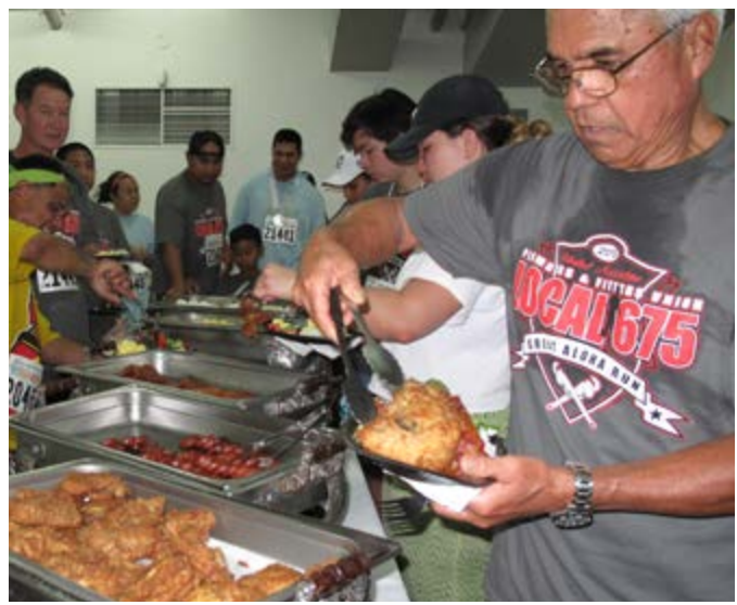
Members and their families in line at the Union's breakfast buffet.