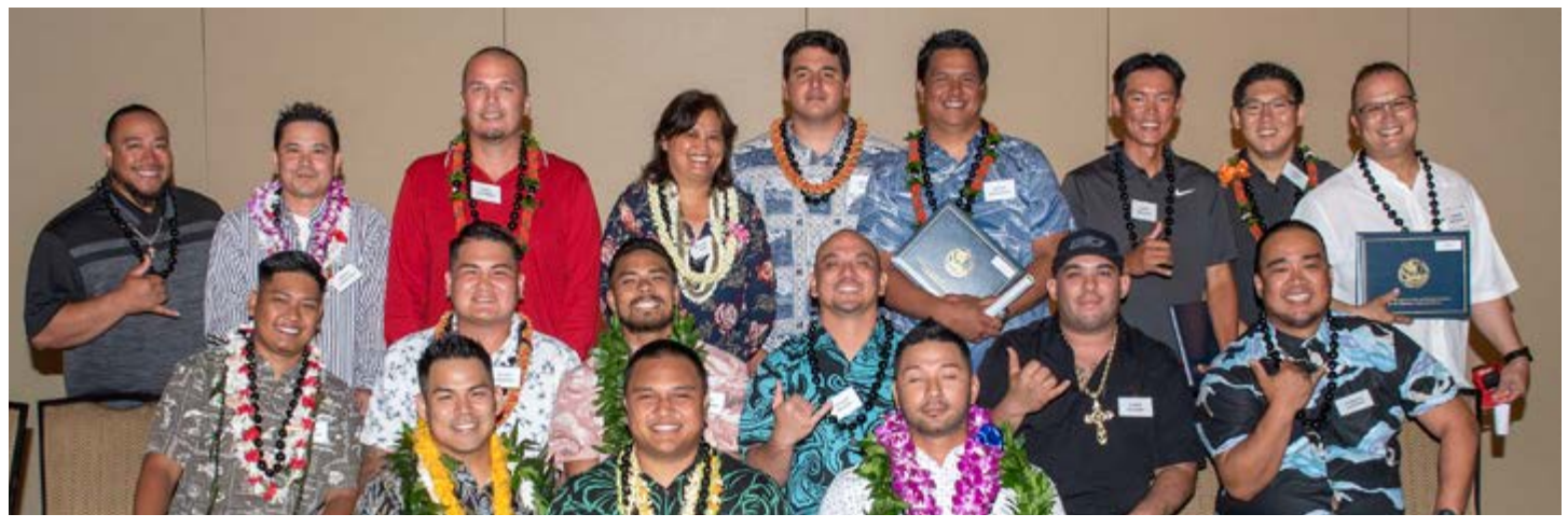
Happy group of graduating apprentices.