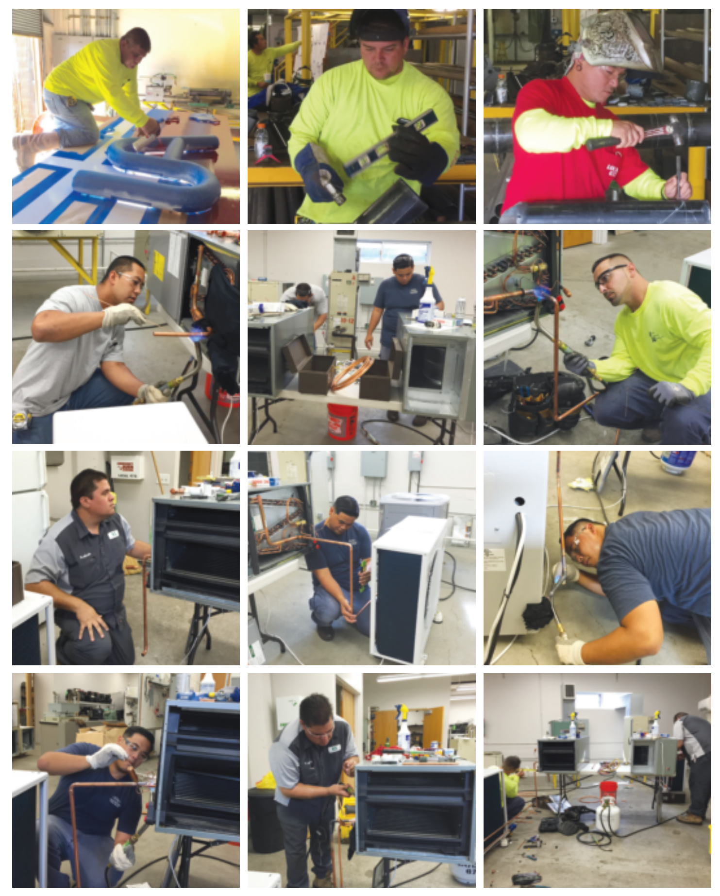
more photos on page 5